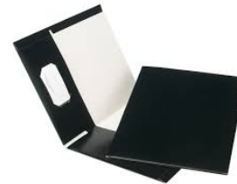
Report Cover with Twin Pockets