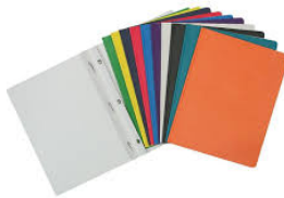
Report Covers with Tangs