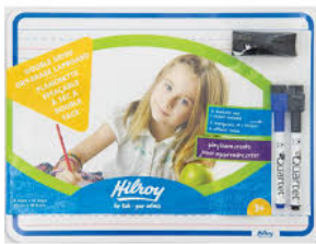
Dry Erase Board