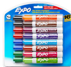
Dry Erase Markers